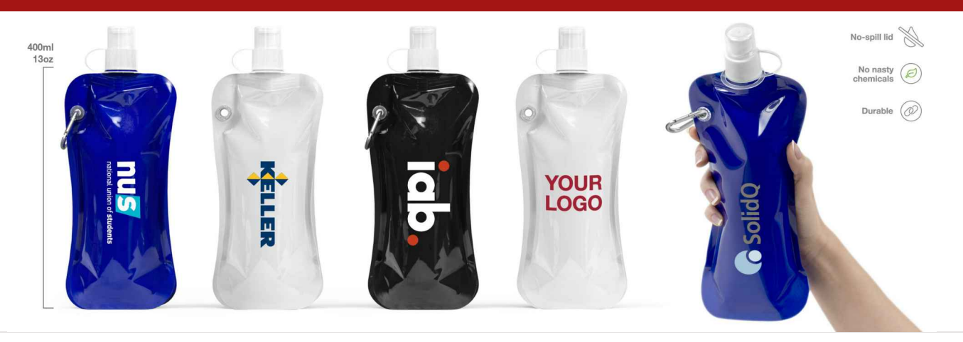
The Marathon Drink Pouch is a compact and stylish promotional product that is ideal for your next Conference or Event. The Marathon can hold up to 400ml of cold liquid and can be branded with your logo, slogan and more. All in ultra-precise detail.